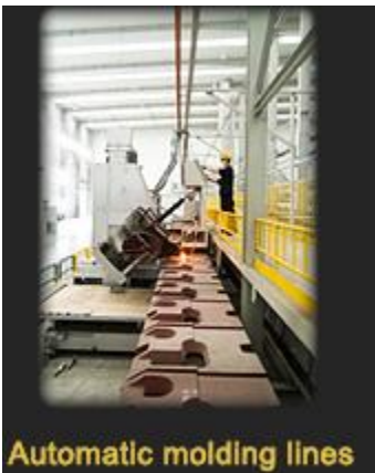
Automatic molding lines