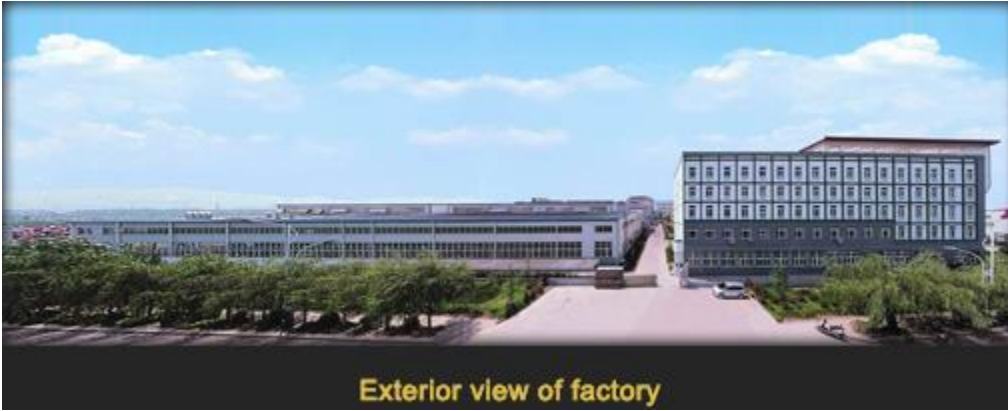
Exterior view of factory